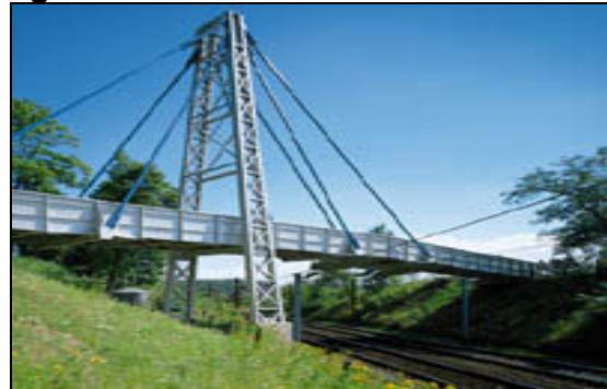
Build Wrap GF [Glass Wrap] with Build Strength CF [Carbon Fiber H Beam & Other Profiles], Are install for Bridges Span, since 1992

GLASS FIBER Build Wrap GF® is a fabric sheet of longitudinal oriented, continuous glass fiber filaments which are held in position by a lightweight, open mesh, glass scrim. Build Wrap GF® has robust handling and rapid wet-out characteristics which make it ideal for on-site strengthening of structural of buildings, bridges, beams, columns and marine structures. Additionally, Build Wrap GF® is compatible with all commonly used resin systems which can be applied using a variety of wet-out/resin infusion techniques.