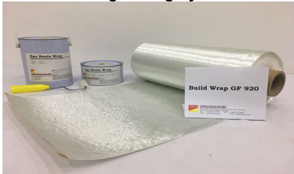
Build Wrap GF, Standard Tensile Strength & Tensile Modulus, Glass Fiber [Wrap] Roll Size

Strengthening System for Buildings & Bridges Structures or Timber Woods