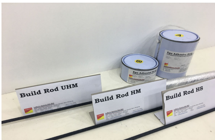
Build Rod HS, Size: 7.5, 10, 12 & 16Ømm