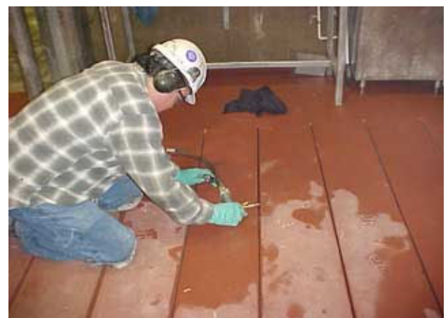
Build Rod HS 16, install on top Slab