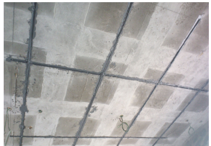
Build Rod HS 16, install under Slab